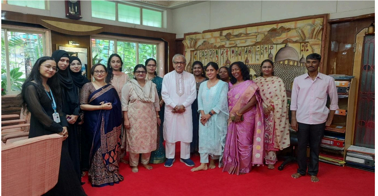
The Faculty with The Esteemed Founder Of our College.