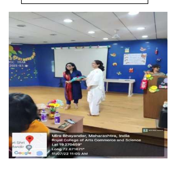
Introductory and Welcome Note of the Resource person