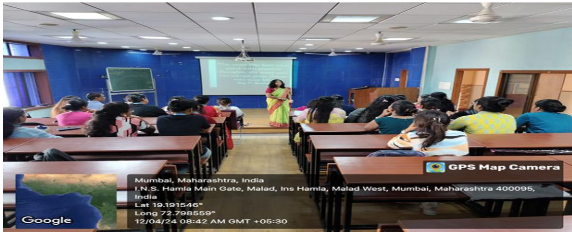
ATTENDEES ATTENDING THE TALK