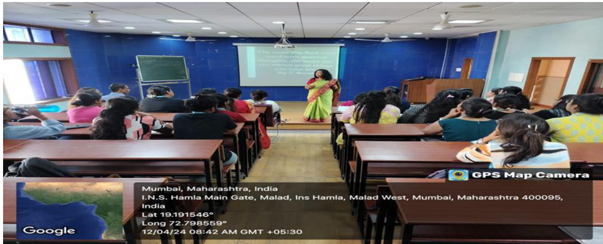
PRINCIPAL MA'AM ADDRESSING THE CLASS