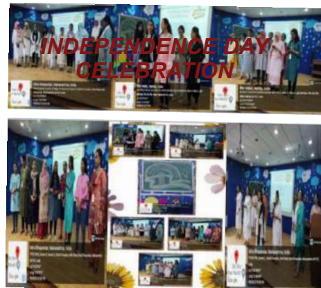
PATRIOTIC SONG SINGING