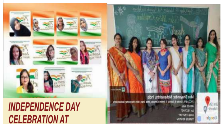
INDEPENDENCE DAY CELEBRATION AT