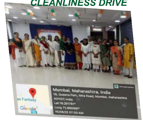
INDEPENDENCE DAY CELEBRATION AT S.V.P.V .