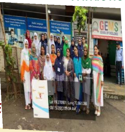
INDEPENDENCE DAY CELEBRATION AT GEMS SCHOOL OF EXCELLENCE