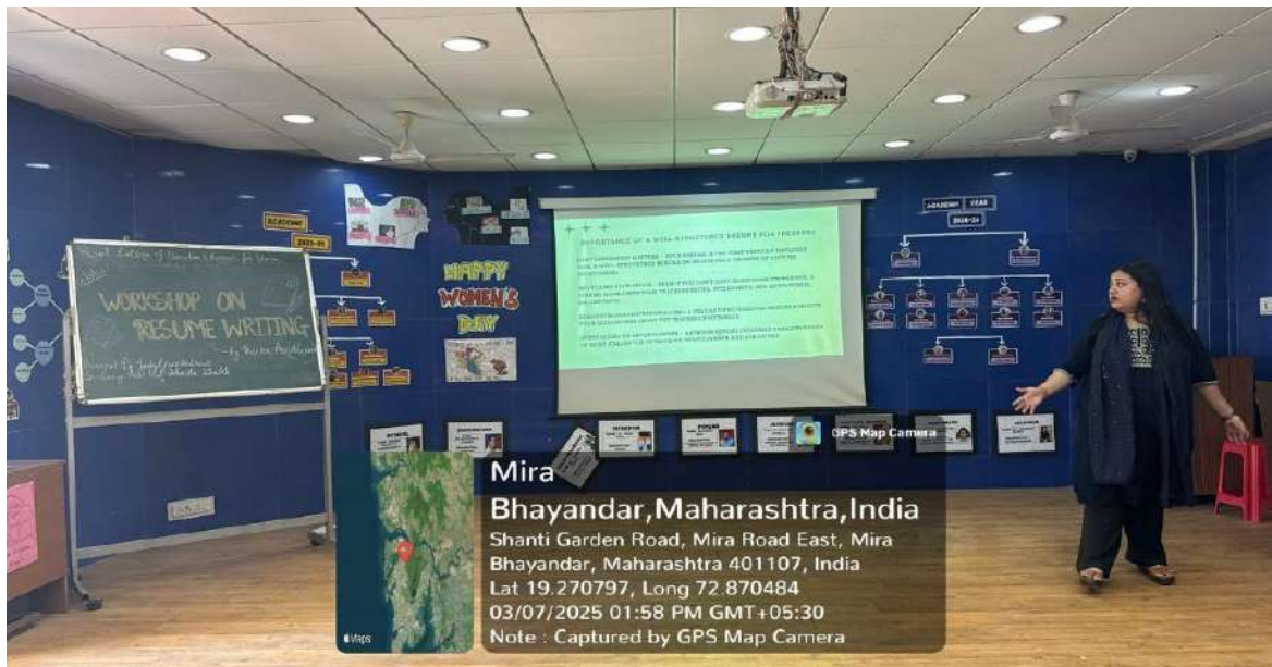
MS. Vedika Aer while explaining key structured resume for fresher