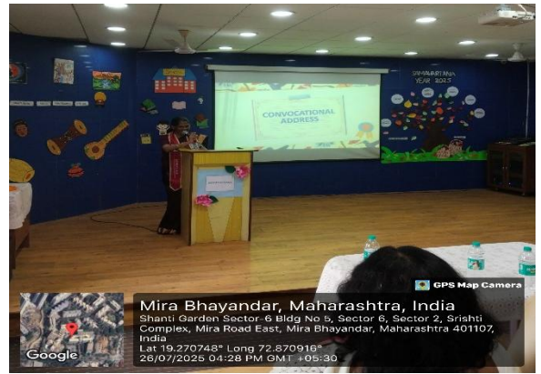
Mira Bhayandar, Maharashtra, India Shanti Garden, Sector 6 Bldg No 5, Sector 6, Sector 2, Srishti Complex, Mira Road East, Mira Bhayandar, Maharashtra 401107, India Lat 19.270748° Long 72.870916° 26/07/2025 04:28 PM GMT +05:30