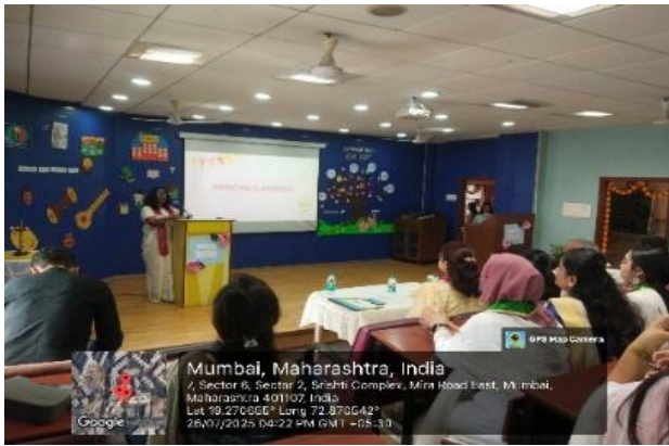
Mumbai, Maharashtra, India 7, Sector 6, Sector 2, Srishti Complex, Mira Road East, Mumbai, Maharashtra 401107, India Lat 19.270665° Long 72.870642° 26/07/2025 04:22 PM GMT +05:30