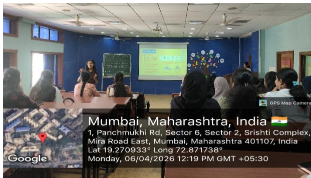
Mumbai, Maharashtra, India 1, Panchmukhi Rd, Sector 6, Sector 2, Srishti Complex, Mira Road East, Mumbai, Maharashtra 401107, India Lat 19.270933° Long 72.871738° Monday, 06/04/2026 12:19 PM GMT +05:30