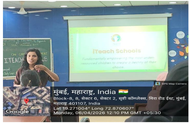
मुंबई, महाराष्ट्र, India Block-8, 8, सेक्टर 6, सेक्टर 2, सृष्टी कॉम्प्लेक्स, मिरा रोड ईस्ट, मुंबई, महाराष्ट्र 401107, India Lat 19.271004° Long 72.870607° Monday, 06/04/2026 12:10 PM GMT +05:30