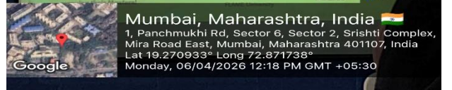
Mumbai, Maharashtra, India 1, Panchmukhi Rd, Sector 6, Sector 2, Srishti Complex, Mira Road East, Mumbai, Maharashtra 401107, India Lat 19.270933° Long 72.871738° Monday, 06/04/2026 12:18 PM GMT +05:30