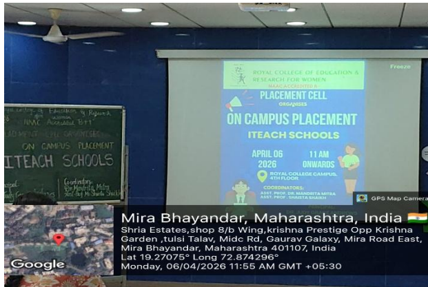
Mira Bhayandar, Maharashtra, India Shria Estates,shop 8/b Wing,krishna Prestige Opp Krishna Garden ,tulsi Talav, Midc Rd, Gaurav Galaxy, Mira Road East, Mira Bhayandar, Maharashtra 401107, India Lat 19.27075° Long 72.874296° Monday, 06/04/2026 11:55 AM GMT +05:30