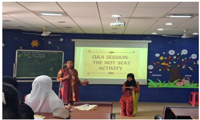
7E Lesson Demonstration by Peer (S.Y.B.Ed)