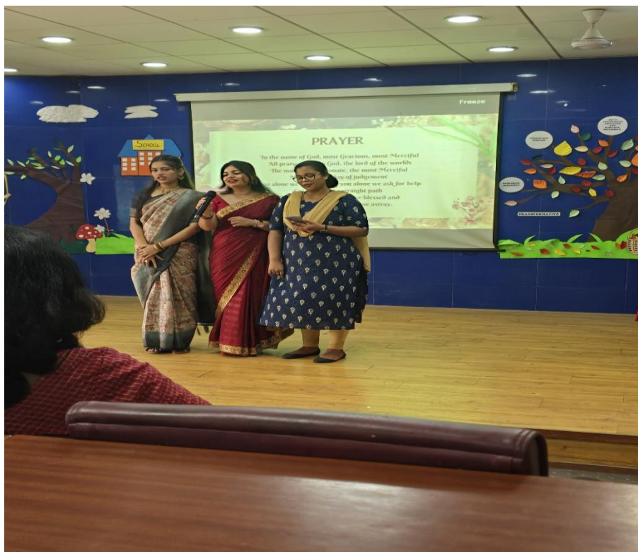
मिरा भाईंदर, महाराष्ट्र, India Canteen, Royal College Of Arts Science And Commerce, सेक्टर 6, सेक्टर 2, सुधी कॉम्प्लेक्स, मिरा रोड ईस्ट, मिरा भाईंदर, महाराष्ट्र 401107, India Lat 19.270705° Long 72.870992° 06/09/2025 09:51 AM GMT +05:30